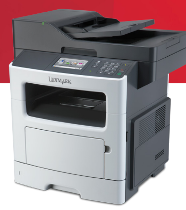
MX510de / MX511de/dhe

The Lexmark MX510 Series multifunction product (MFP) saves time with fast processor, print, copy and scan speeds—plus delivers productivity solutions that can propel your business forward. Want more solutions? Choose the MX511de featuring fax, or the MX511dhe with fax and hard disk drive.